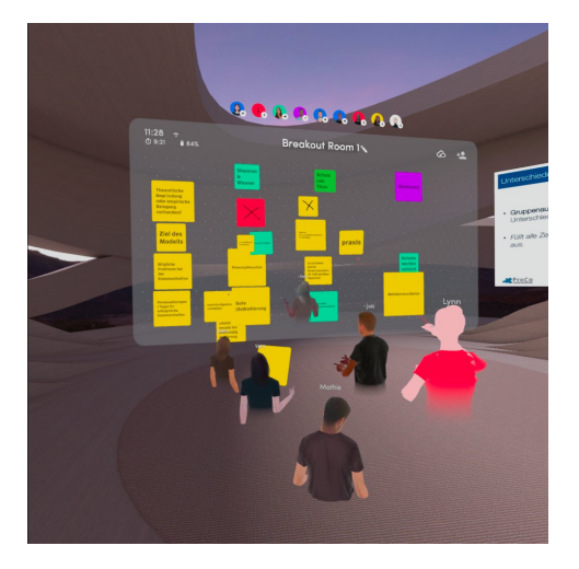
Figure 1. Students compare communication theories using a virtual whiteboard in Spatial

on GitHub<sup>1</sup>. Digital Card (DC) games are widely used in different levels of education to offer a more compelling, personalized, and exciting learning experience [26]. Furthermore, DCs are powerful tools for learning towards school curriculum by game-construction and gameplay [27]. The multi-player game aims to repeat and foster course content by providing collaboration and communication features as, for example, proposed in Boticki et al. [28] or in George et al. [29]. The "VR-Learning-Game" consists of two phases in order to play the game: (1) setting up the card topics and (2) asking for assigned topics.