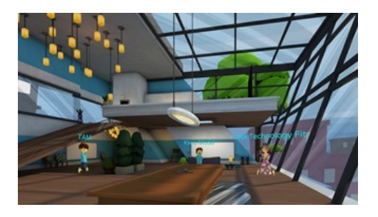
Figure 2. Students playing the VR-Learning-Game to study course content

presented in a virtual world. The VR experiment thereby served a twofold purpose as experiment and learning experience. As a side effect, this provided a realistic setting for the experiment.