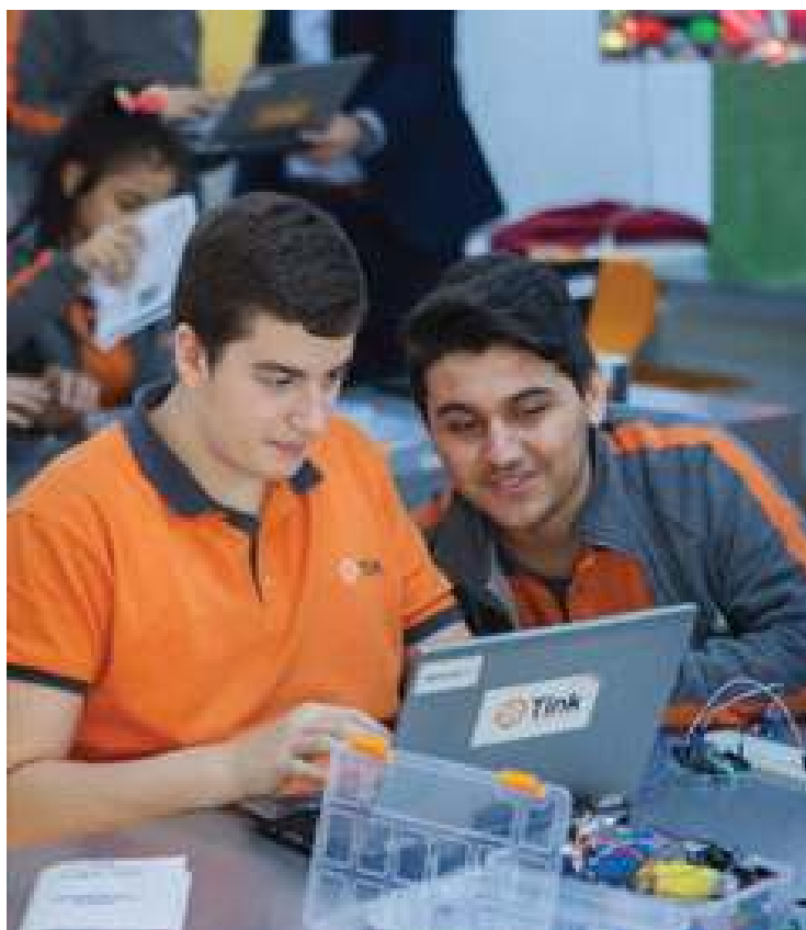
Picture 3 – Tink Technology school

Active learning is also supported through STEM (Science, Technology, Engineering, Mathematics) education. STEM is an approach to learning integrating the areas of science, technology, engineering and mathematics. Rather than teach the disciplines as separate and discrete subjects, STEM integrates them into a cohesive learning paradigm based on real-world applications. The focus of a STEM education is therefore hands-on, problem-based learning. Hence, this educational approach develops knowledge and skills enabling the identification of solutions to problems related to ever-changing and complex contexts.