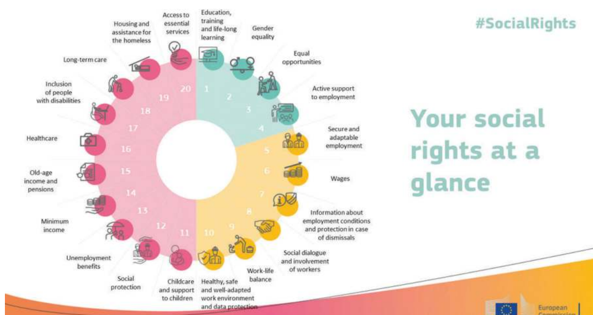
Figure 1. The European Pillar of Social Rights in 20 principles

The Social Pillar highlights the contribution of Education, training and life-long learning in the attainment of the skills necessary for full participation in the labour market and society. This emphasis on skills and life-long learning was crucial for the subsequent development of EU and national policies ensuring access to quality education and training supporting individuals' adaptation to the multiple challenges of our time. The European Pillar of Social Rights Action Plan additionally established concrete actions and targets for the EU and its Member States to reach by 2030, including the achievement of 78% of the population aged 20 to 64 in employment, 60% of all adults participating in training every year, and a reduction of 15 million in the number of people at risk of poverty and social exclusion.